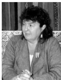
Carol Ann Duffy – Scottish poet and playwright. Professor of Contemporary Poetry at Manchester University. Current British Poet Laureate

This little book, charmingly illustrated, is the Poet Laureate's account of the moment that 'peace found a place in 'No Man's Land' in World War I.